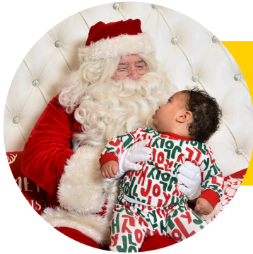
Entertained 200+ children and their families at Photos with Santa (Bethesda North), Cookies with Santa (Arrow Springs) and pictures with the Easter Bunny.