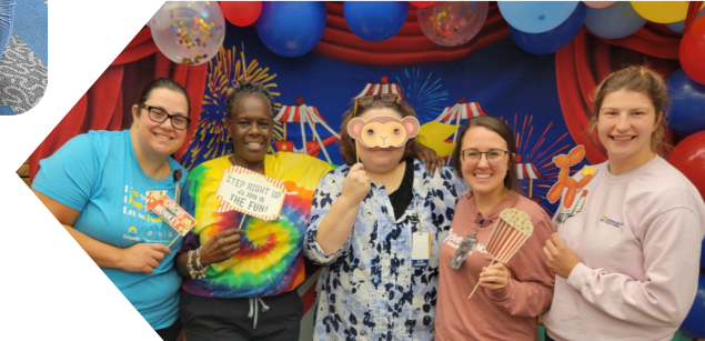
Summer Celebration 2024