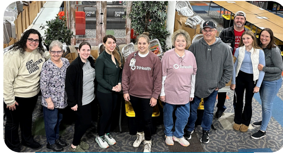
Worked with Operation Give Back to serve 72 families and 392 individuals a Thanksgiving meal.