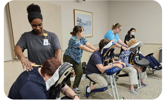
Summer social with free massages